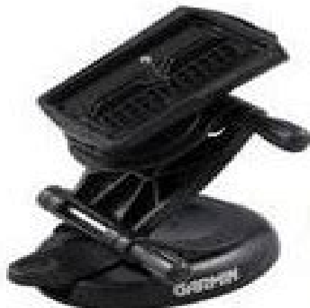
automotive dash mount