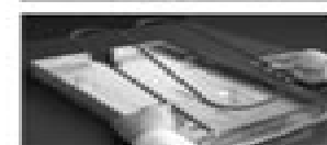
Quick access heating element and thermostat, for easy service