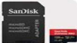
SanDisk 128GB Memory Card with Adapter