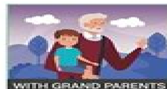
WITH GRAND PARENTS