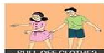
PULL OFF CLOTHES