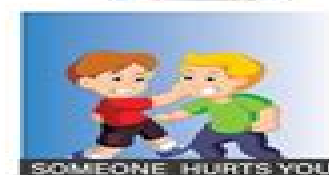
SOMEONE HURTS YOU