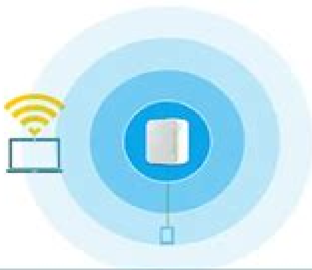
Router Mode or Access Point Mode