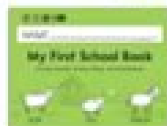
My First School Book Teach children pre-writing and capitals. MF5B-20