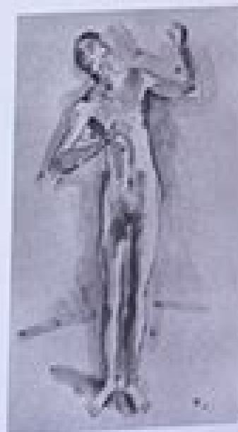
Figure 28: 1916-1917, Front view of male figure

20. Draw the horizontal line, extending from the side of the head to the side of the feet.