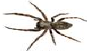
Grey House Spider