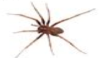
Common House Spider