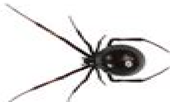
Southern Black Widow