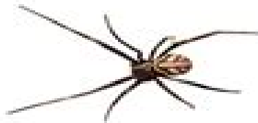
Western Black Widow