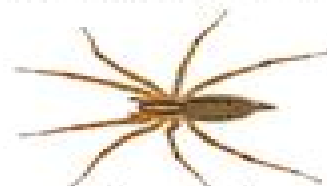
Desert Grass Spider