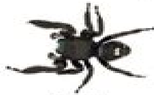
Bold Jumper Spider