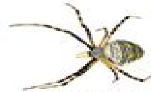
Banded Garden Spider