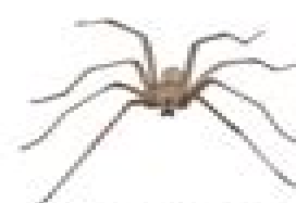
Southern House Spider