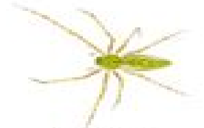
Green Lynx Spider