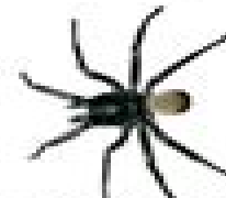
California Trapdoor Spider