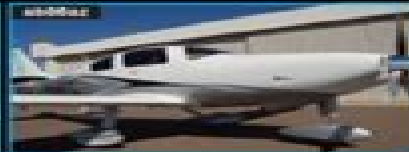
2013 Cessna 400 Corvallis TTx With Intrinsic Flight Deck & G2000 All Glass Cockpit! Speed, Comfort, Safety & Style! Secure Your SN Now. $733,950