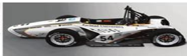
Fig.1 Formula Student Vehicle - construction and final result