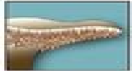
Fingers: many small finger-like projections