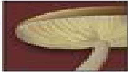
Gills: long and thin sheets like plates radiating from stem