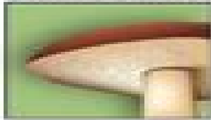
Spones: many small tubes ending in a sponge surface