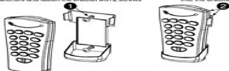
Figure 2 - Mounting