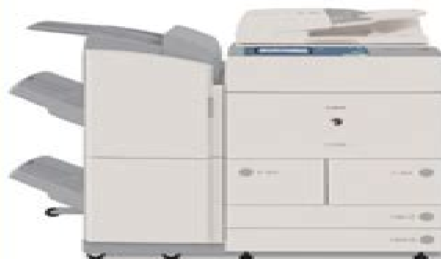
imageRUNNER 5075 Device Shown with Optional Accessories