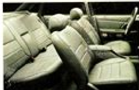
Grande espaço interno e facilidade de acesso a todos os comandos. Plota automática. Direção ajustável.