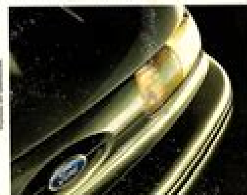
Estilo moderno, aerodinâmico. Motor 3.0 V6 com injeção eletrônica sequencial. Transmissão automática de 4 velocidades.