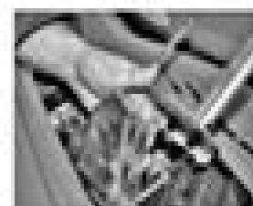
11.49 ... then remove the bracket

35 Working through the storage tray (previously undo the four bolts securing the brackets and mounting bracket in the block (see illustration).