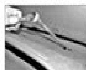
11.49 ... and remove the four upper retaining bolts

42 Undo the four outer mounting bolts from the face on both sides (see illustration).