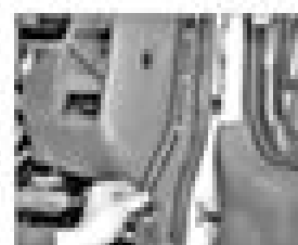
11.49 Release the retaining clip and remove the head upper retaining bolts from the face on both sides