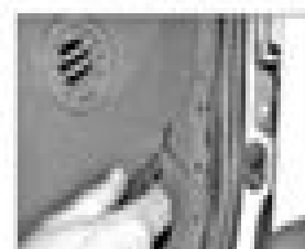
11.49 Using a small screwdriver, release the bolt covers from the face on both sides