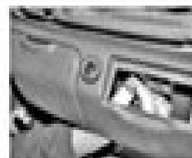
11.45 ... and disconnect the wiring connector from the opposite lighter