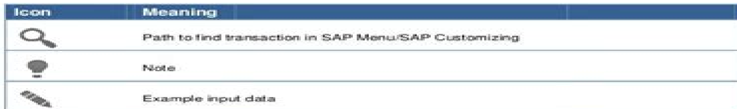
TABLE OF SYMBOLS