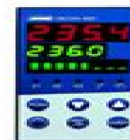
JUMO DICON 400 Type 703575/1...