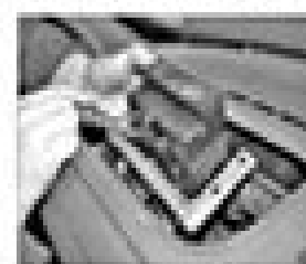
11.48 Release the retaining clips and remove the head using the and the positioned edge flange from the mounting bracket