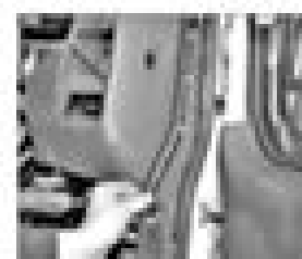
11.46d Release the retaining clips and remove the head using the and the positioned edge flange from the face on both sides