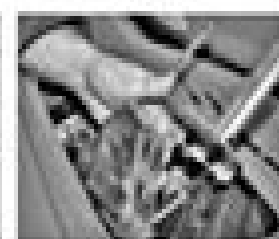
11.49 Then remove the bracket

35 Working through the storage tray (previously undo the four bolts securing the brackets and mounting bracket in the block (see illustration).