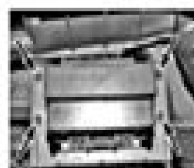
11.47 Undo the four bolts (previously securing the head) using the mounting bracket in the block