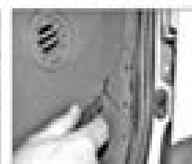
11.46e Using a small screwdriver, release the bolt covers from the face on both sides