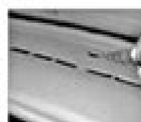
11.46a Lift off the two covers

42 Undo the four outer mounting bolts from the face on both sides (see illustration).