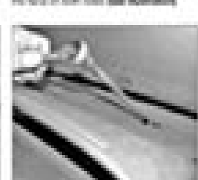
11.46b Then remove the four upper retaining bolts

43 Undo the four outer mounting bolts from the face on both sides (see illustration).