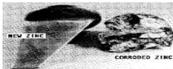
A new trim tab zinc, left, and a corroded zinc, right. An excellent example of the inexpensive zinc saving more costly parts of the outboard unit.

different zincs on all metal parts and thus run the risk of wood burning. Another route, is to use one large zinc on the transom of the boat and then connect this zinc to every underwater metal part through internal bonding. Of the two choices, the one zinc on the transom is the better way to go.