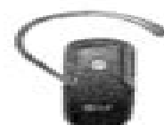
On the left