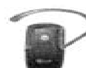
On the right