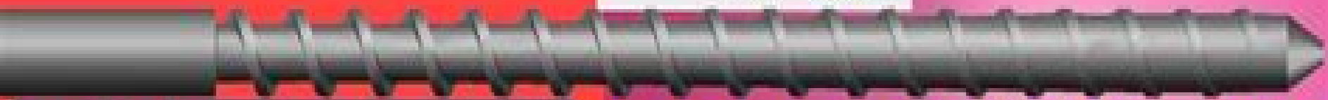
¾ RATIO THREAD CHART