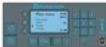
Image: Husqvarna Automower

Charging with battery power. The mower starts with a battery. When the battery is low, the mower will start to charge. When the battery is low, the mower will start to charge. When the battery is low, the mower will start to charge.