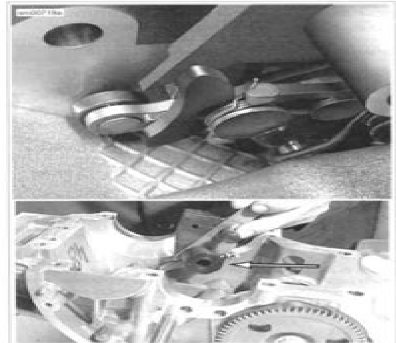
Figure 6-37. Shift Mechanism/Retractor (HD-45339)