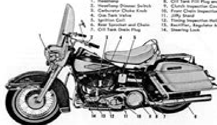
FIGURE 2. LEFT SIDE VIEW