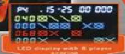
LCD display with 8 player scoring

Includes: 6 darts with spare tips Game manual AC Adapter