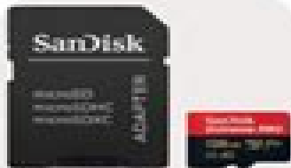
SanDisk 128GB Memory Card with Adapter