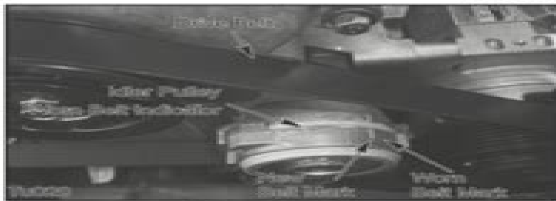
6 Cylinder Drive Belt