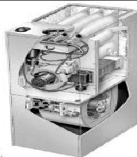
G26 FURNACE ←G26 HEAT EXCHANGE ASSEMBLY

Information contained in this manual is intended for use by qualified service technicians only. All specifications are subject to change. Procedures outlined in this manual are presented as a recommendation only and do not supersede or replace local or state codes. In the absence of local or state codes, the guidelines and procedures outlined in this manual (except where noted) are recommended only.