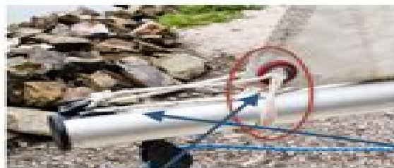
Tie clew to boom