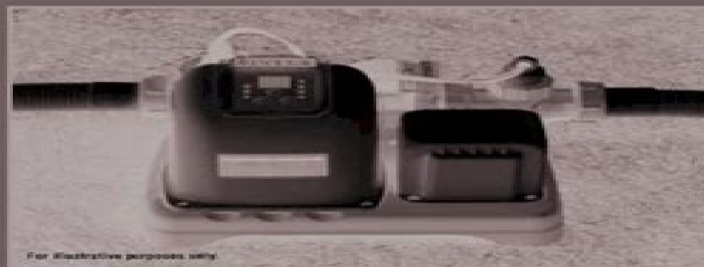
For illustrative purposes only.

Model CS8220 220 - 230 V~, Model CS8230 230 - 240 V~