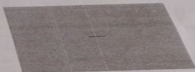
Figure 2: Grey