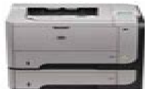
HP LaserJet P3015x Printer 2