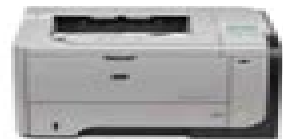
HP LaserJet P3015dn Printer 2