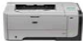
HP LaserJet P3015d Printer 2