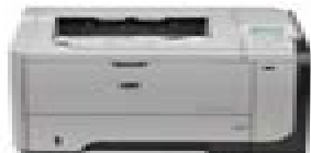
HP LaserJet P3015 Printer 2

Get fast, high-performance printing with advanced security features. 1 Expand as your business needs change, using an open EIO slot, open memory slot, two internal accessory ports for connecting HP and partner solutions, and optional paper trays.