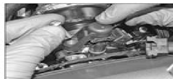
10.4 Displace the injector

11 Pull the cylinder head off (see illustration). If it is stuck, tap around the joint face between the head and the cylinder with a soft-faced mallet to free it. Do not attempt to free the head by levering with a screwdriver between the head and cylinder – you'll