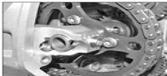
9.7b The screw fits into the inner of the two holes in the axle on the right-hand head...