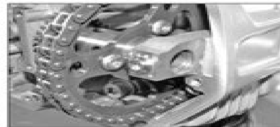
9.7c ...and into the outer hole on the left

on removal (see illustration). Align the bones and insert the axle, shouldered end first and screw holes facing away from the head (see illustration 9.3b). Align the screw holes and tighten the screw to the specified torque (see illustrations).