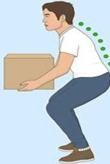
Healthy Back Muscles