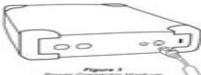
Figure 1 Power Connector Hook-up