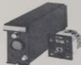
KXP 755 TRANSPONDER