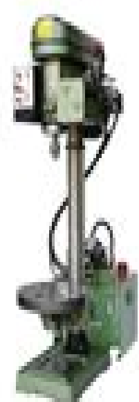
Drill press machine