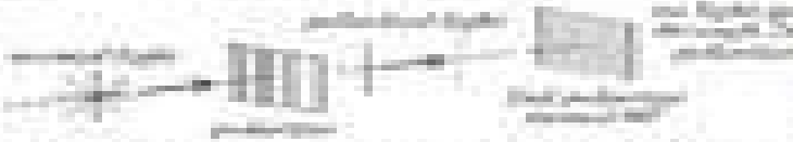
The visible light spectrum is the part of the electromagnetic spectrum that we can see. It ranges from about 400 nm to 700 nm.

Visible light is the part of the electromagnetic spectrum that we can see. It ranges from about 400 nm to 700 nm.