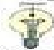
Phosphor-coated light bulb

Luminescent light is very different from incandescent light. It is much brighter and lasts longer.