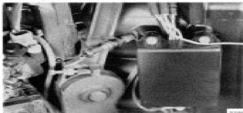
a - Maximum Spark Advance Screw