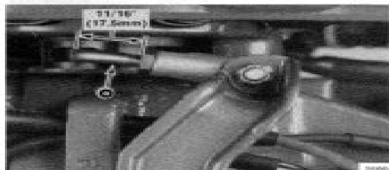
a - Trigger Link Rod

IMPORTANT: If trigger link rod was disassembled verify that 11/16 in. (17.5mm) is retained.