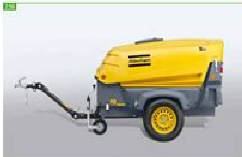
Un compresor transportable moderno para trabajos de construcción

frecuentemente incluye de serie de la instalación de compresores en distintos niveles, desde una visión general hasta detalles de máquinas específicas.