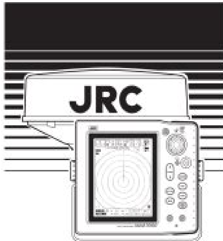
RASTER SCAN RADAR RADAR3000