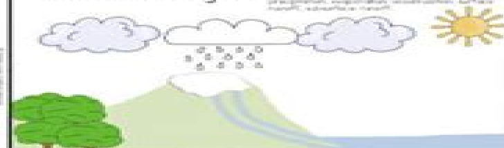
The Water Cycle