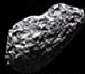
astéroïdes & comètes