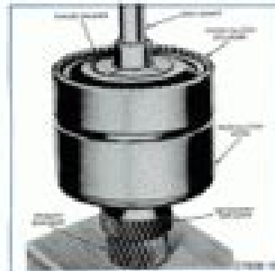
Fig. 41 - Input Shaft and Chock in Holding Device