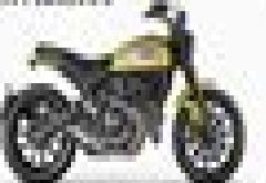
SCRAMBLER MACH 3.0