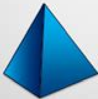
Triangular based pyramid