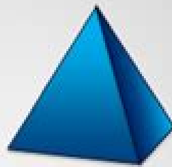
Square based pyramid