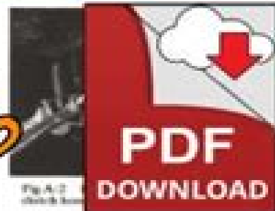
Fig. A.2 Starting motor