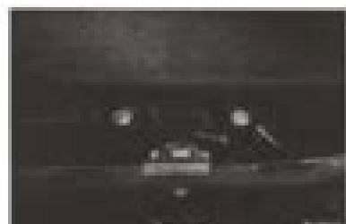
Fig. A.6 Front lock pump - 4 cylinder engine only

Remove the oil seal and take off the oil seal from the engine block. Remove the oil seal from the engine block. Remove the oil seal from the engine block. Remove the oil seal from the engine block.