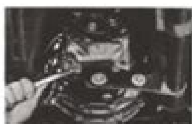
Fig. A.4 Removing the exhaust pipe support bracket on the exhaust pipe