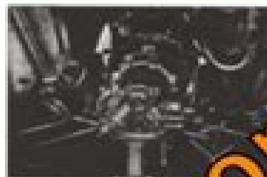
Fig. A.1 Removing the starting motor