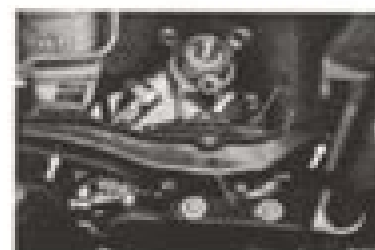
Fig. A.5 Removing the exhaust pipe support bracket - automatic transmission