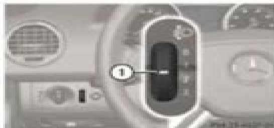
① Ruedecilla de ajuste