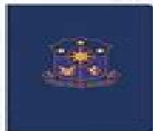
Seafarer's Record Book or Seafarer's Identity Document