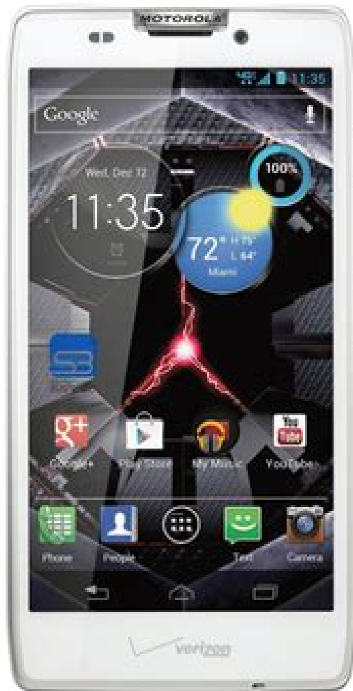
DROID RAZR HD